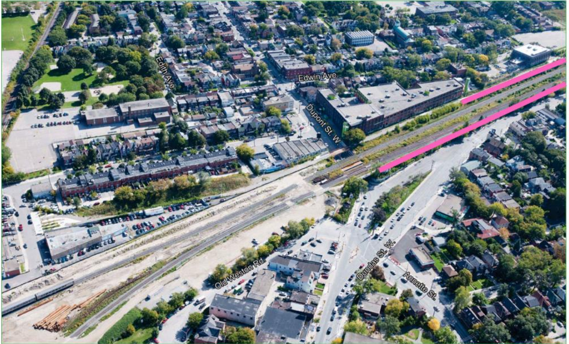
5 m height noise barriers (both sides of rail corridor)